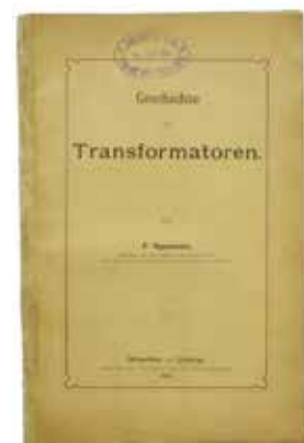
Figure 1. History of the transformers, F. Uppenborn

F. Uppenborn, Geschichte der Transformatoren (History of the transformers), de Gruyter, Munich - Leipzig, Pages 60, 1888; Reprint 2019; Reprint 2020 [11]