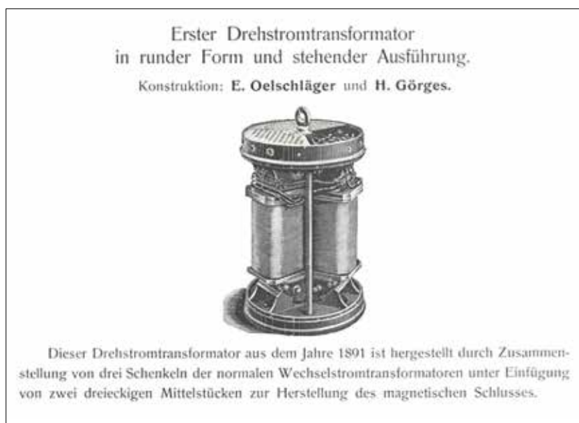
Figure 2. A three-phase transformer

Heinrich Kratzert , Grundriss der Elektrotechnik : Für den praktischen Gebrauch, für Studierende der Elektrotechnik und zum Selbststudium T. 2: Transformatoren, Akkumulatoren, elektrische Beleuchtung und Kraftübertragung mit besonderer Berücksichtigung der elektrischen Eisenbahnen (Basics of electrical engineering: For practical use, for students of electrical engineering and for self-study T. 2: Transformers, accumulators, electrical lighting and power transmission with special consideration of the electri-