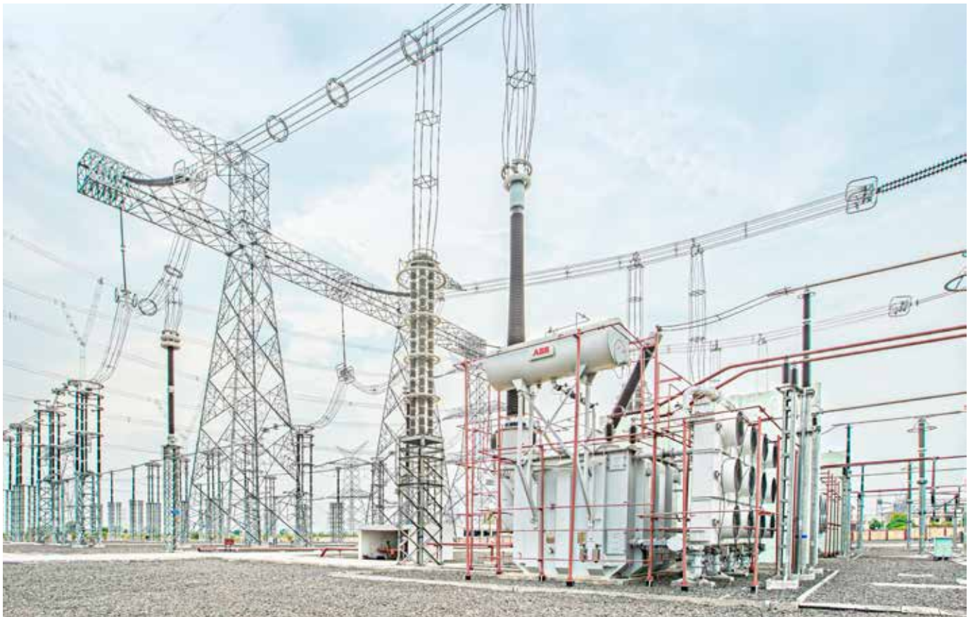
Figure 4. 1200 kV AC Power transformer at the substation in India

dustry, specifically associated to knowledge management, considering the high level of expertise behind those type of units to secure a reliable and long operation.