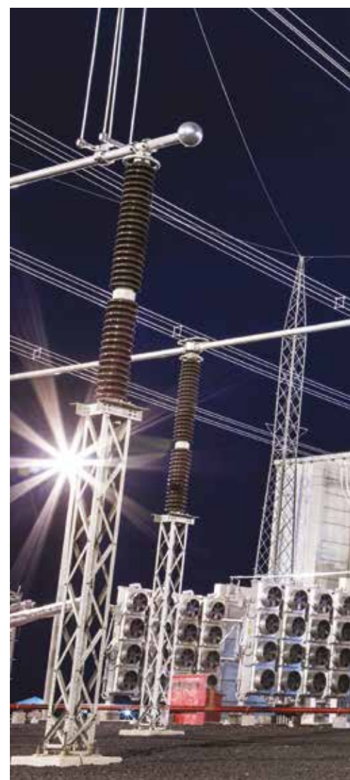
Figure 1. Seven 600 kV HVDC transformers as a paradigm of transformer innovation

transformers, innovation, energy, renewables, data centers, digitalization, energy efficiency, ultra-high voltage, generator transformers, dry transformers, power transformers, HVDC, FACTS, STATCOM, machine learning, nanomaterials, additive manufacturing, 3D printing, asset management, traction transformers