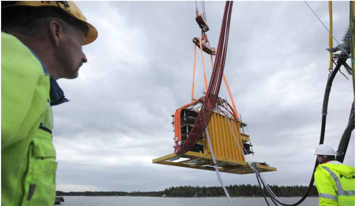
Figure 9. Subsea transformer