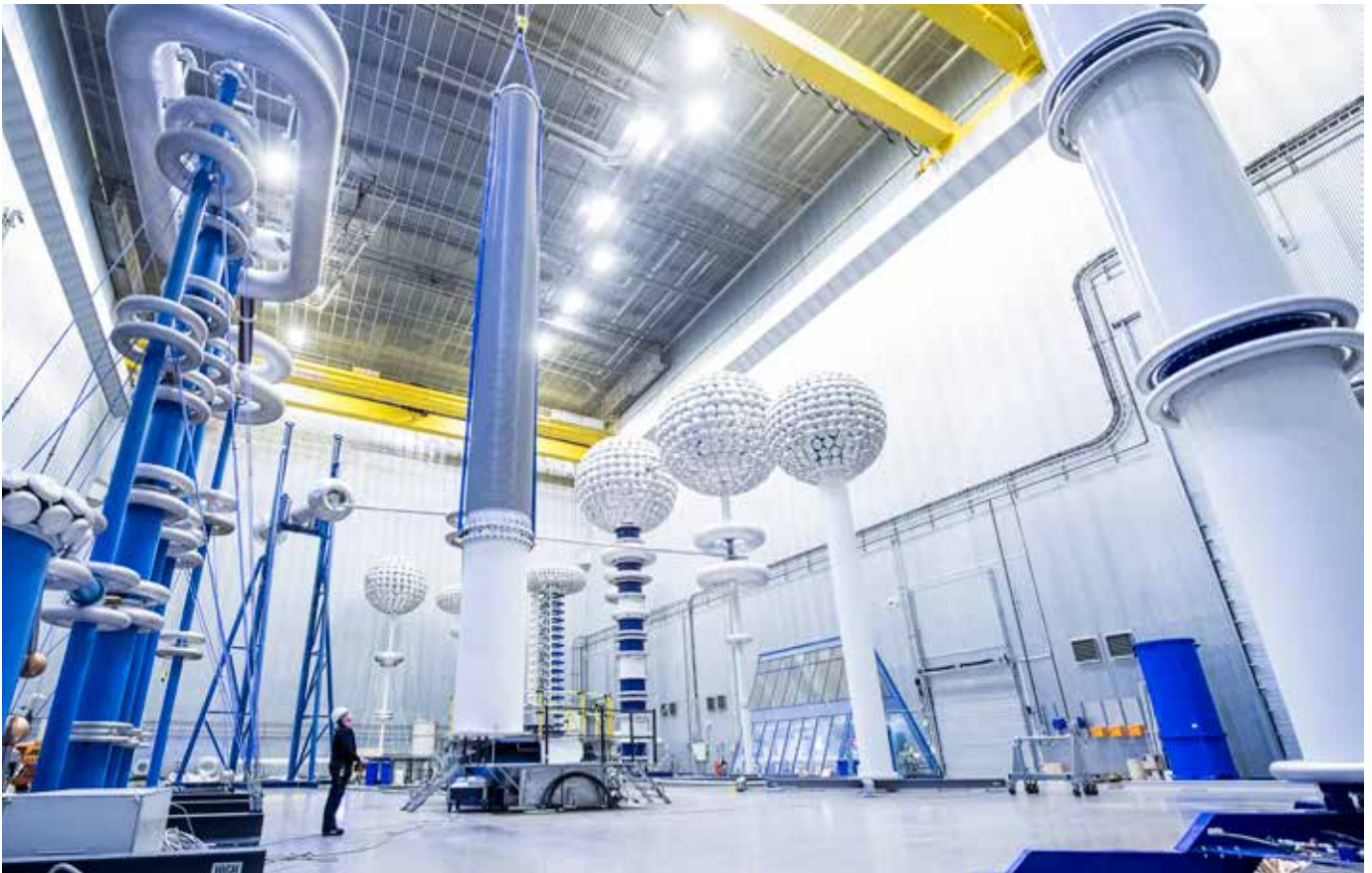
Figure 3. 1100 kV DC Bushing