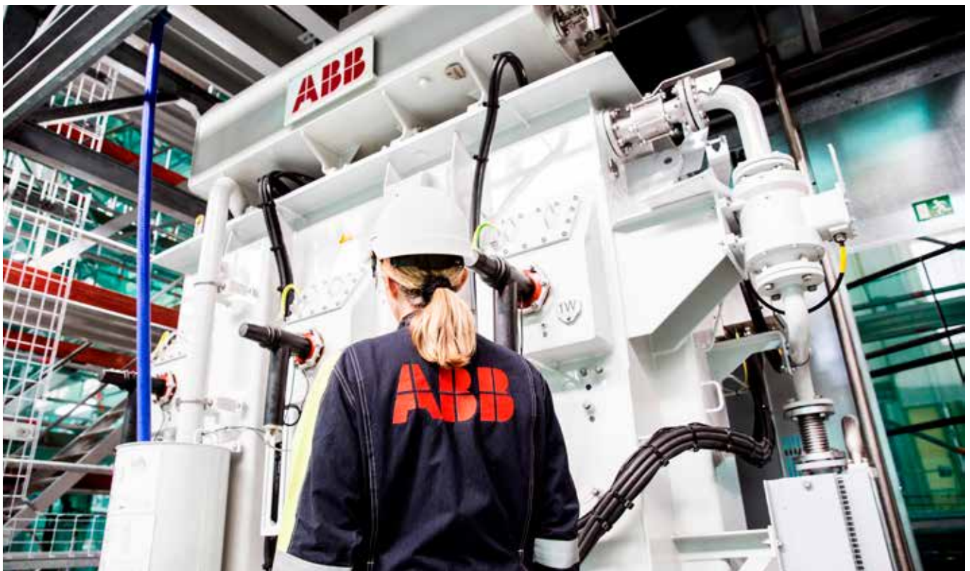
Figure 10. 66 kV WindSTAR transformer for installation in wind turbine towers or nacelles