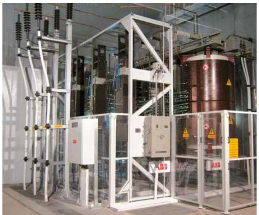
Figure 5. 72 kV HiDry transformer with OLTC

The boundaries are also being pushed up in smaller size transformers with dry transformers today reaching voltage levels up to 145 kV