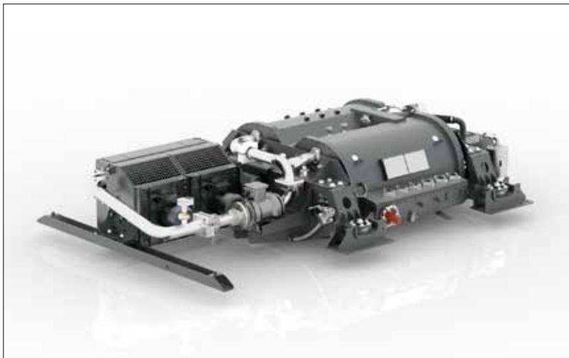
Figure 6. Effilight, an innovative solution to get lightweight traction transformers

In contrast with Low-frequency transformers (LFTs) that are directly connected to the grid [the operating frequency (fundamental frequency) being the grid frequency, i.e. 16.7, 50, 60 Hz], MFTs are connected to converters (DC/AC, AC/DC, DC/DC). The fundamental fre-