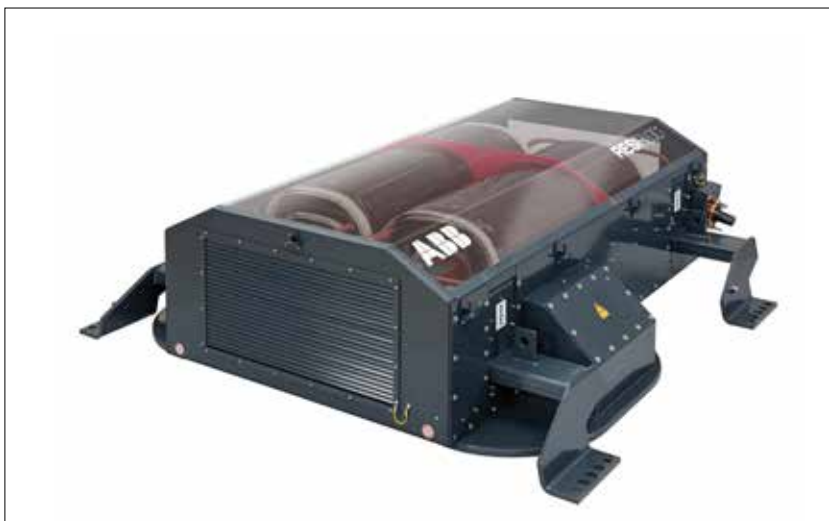
Figure 7. Resibloc traction, dry transformers for railways traction