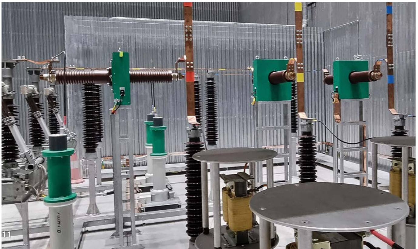
TMS 580 100 kV 3000 A: Transformer Loss Measuring System

Understanding the Criticality of Spare Parts: Take the example of an impulse voltage generator. For each test, the operator eventually needs to exchange the front and parallel resistors to adjust the waveform. Climbing up and down the tall generator introduces a risk of dropping and damaging the resistors. These resistors, especially if they have custom resistance values, often have long lead times. Therefore, it is wise to stock a few spare units on-site to avoid lengthy downtimes. In contrast, other components, such as charging capacitors, may be less critical. These capacitors are often standardized across different generator sizes and are typically available from the manufacturer's stock. They can be quickly shipped for repairs, making it less urgent to stockpile these items. In this situation, a strong relation-