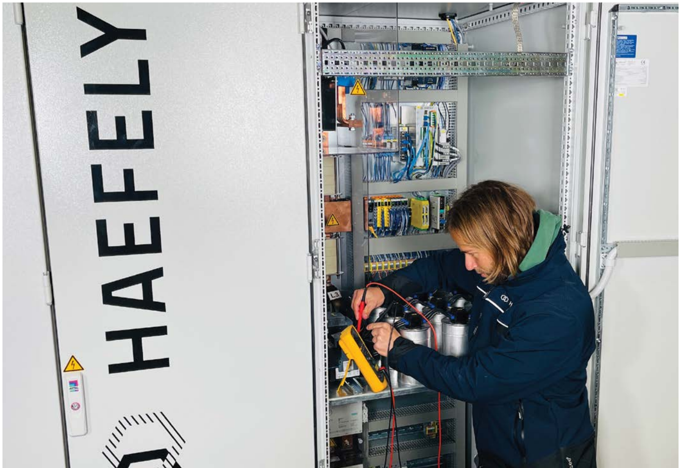
Proactive Maintenance for HAEFELY Systems

Comprehensive training programs for operators are essential for maximizing system performance and safety. State-of-the-art systems often come equipped with advanced software modes and user-friendly graphical interfaces designed for intuitive operation. However, achieving optimal performance requires a deep and thorough understanding of the system's full capabilities. Without this knowledge, operators might not fully leverage