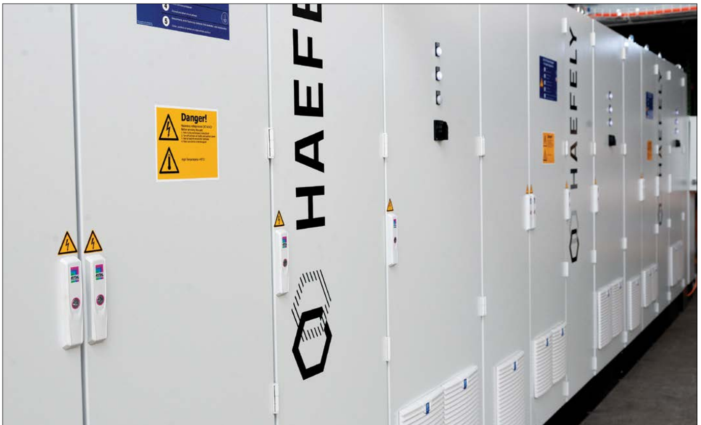
EPS 1500 kVA Electronic Power Supply

Promoting the advantages of EPS over traditional motor generators requires significant effort. However, since 2012, we have not lost a single project to these older technologies and are now proudly